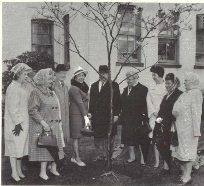
Planting the "official" Magnolia tree at Rockville Centre, Long Island, N. Y.