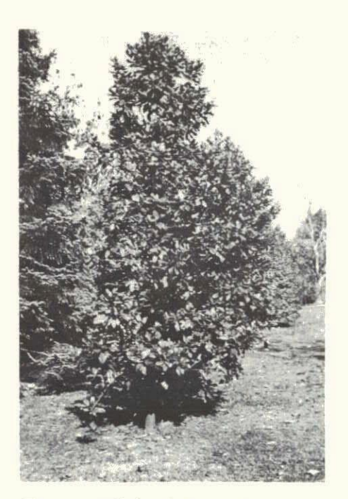
The compact habit of 'Praecox Fastigiata' is evident in this photo of the specimen at Barnes Arboretum.