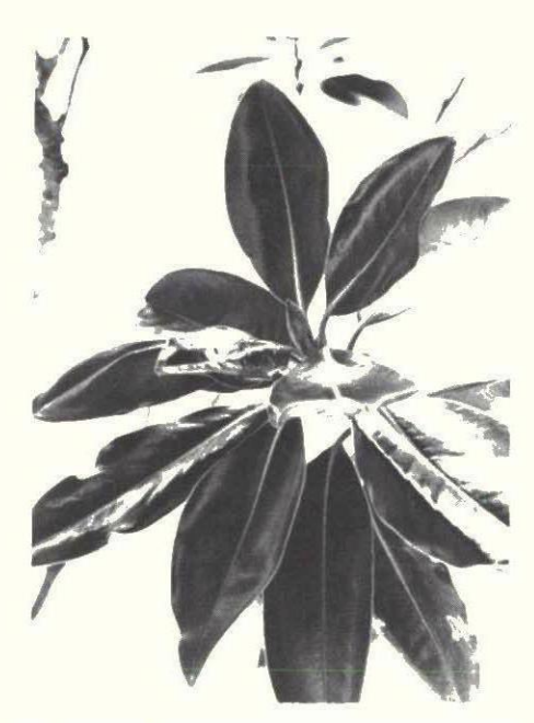
M. grandiflora 'Little Gem' branchlet and latent flowerbud in winter. Orange indumentum gives foliage a bronzed appearance.

The National Arboretum plant of 'Little Gem' was received from Warren Steed of