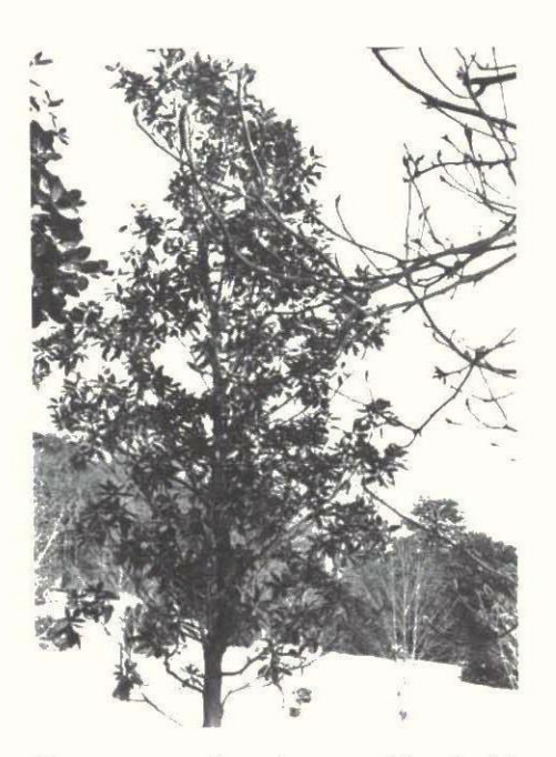
Short, upswept branches are evident in this photo of 'Little Gem' at the National Arboretum. It is not so dense as 'Praecox Fastigiata.'

Cytological study of 'Little Gem' would probably reveal a normal hexaploid chromosome count as in M. grandiflora, and even and normal chromosome reduction in pollen and egg cell production. Such factors would establish, as suspected here, that 'Little Gem' is not a hybrid. From limited reports only a little is known about the hardiness of 'Little Gem.' During the severe winter of 1977-78 when many M. grandiflora from Virginia north were injured, especially those in exposed sites, outright kill of 'Little Gem' was reported in Glenn Dale, Maryland, and in Philadelphia. The single large plant at the National Arboretum came through in good