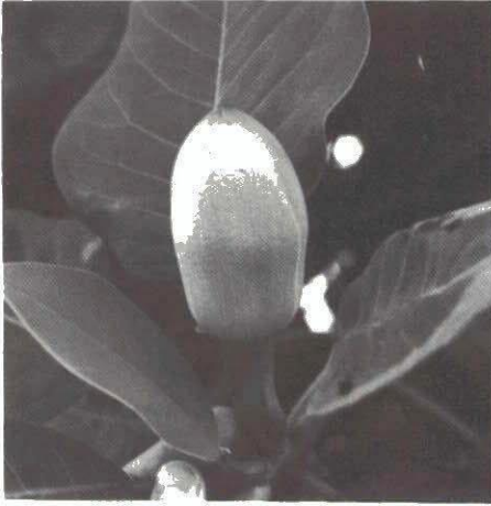
Bud of Magnolia delavayi.

several good examples in the good gardens of the south-western counties. I have also seen it growing well in south-west Scotland. In my garden it has reached 18 feet on a wall where it flowers annually about the end of June or early July."