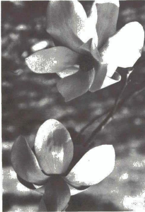
Magnolia sprengeri 'Diva.'

Hupei I saw several hundred trees of this Magnolia in varying sizes, some larger than the one mentioned, but not one did I ever find dowered in full blossom. This was due to the fact that the species blossoms early in April and before the roads are really fit for traveling.