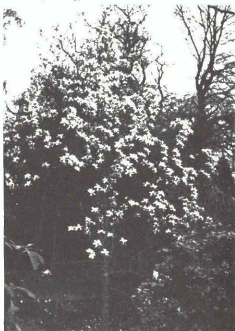
Magnolia campbellii var. mollicomata .

I say "for the most part," because even as a boy I felt frustrated by his brevity in describing individual plant species and forms, when the hunger for such description was my main reason for reading his books. The huge number of plants he covered forced him to buzz wildly from flower to flower like a bumblebee on fermented honey. A more acute frustration, mentioned a few years back in these pages, was my discovery, with pain I can still remember, that in both volumes of "A Naturalist in Western China," Magnolias are mentioned a