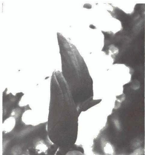
Magnolia sprengeri 'Diva' buds.

My feeling that at long last Wilson was coming around to an appreciation of the Magnoliaceae was strengthened four years later, in 1930, when he favored Magnolias with a ten-page chapter and three full page illustrations in "Aristocrats of the Trees," even giving the genus title billing with the chapter heading, "Aristocratic Magnolias." He still stuck to the old nomenclature, but added a note regarding what he called M. denudata