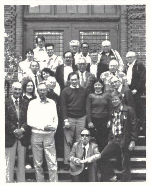
Members attending the meeting at Harvard and Arnold Arboretum pose on some steps before a plant-hunting tour.