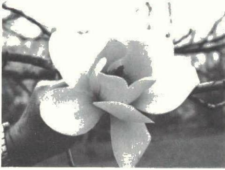
Gresham hybrid at Gloster with 12 tepals.