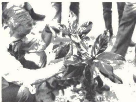
USL Ag Dean Ellis Fletcher displays variegated Magnolia grandiflora plant.

A well articulated color photo slide presentation by Dick Figlar described