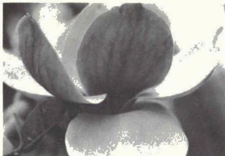
Late-blooming Gresham hybrid in Gloster woods.