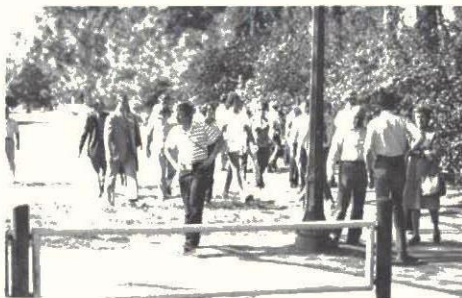
Touring USL campus at Lafayette.