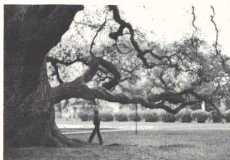
One view of the huge 'Cathedral' oak in Lafayette.