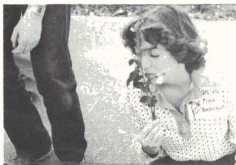
Sniffing Gelsemium sempervirens 'Pride of Augusta' on USL campus.

Like the Louisiana Nursery and other points south, Gloster suffered some damage from the low, low temperatures of the past winter, but it wasn't so obvious as at Opelousas. A fine specimen of Magnolia delavayi