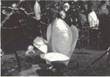
M. 'Sweet Sixteen,' newly introduced Gresham hybrid.

large trees use: M. 'Wada's Memory' or M. × kewensis ; for smaller space and still beauty: M. 'Else Frye' or M. 'salicifolia' from Hesse.