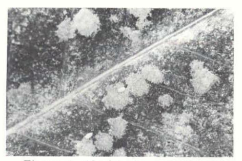
Figure 3. Algal leaf spot (caused by Cephaleuros sp.) on southern magnolia.

Algal leaf spot. Algal leaf spot, caused by Cephaleuros spp., is a problem on southern magnolia in humid, wet locations (Figure 3). Another name for this disease is green scruff. The spots are raised, fibrous, and usually circular with