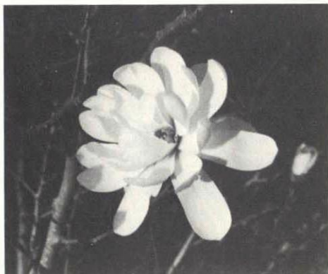
M. stellata 'Royal Star'

So it looks as if we are going to have to get used to a couple of unfamiliar names unless someone comes up with an alternative interpretation. How do you pronounce Latin names? Well there are a few rules which apply as follows: tomentosa is easy, tow-men-TOW-za; praecocissima is more of a tongue twister and goes pry-ko-KISS-i-ma or Pry-ko-SISS-i-ma. The ae is a diphthong with the value of the vowel in, say, 'high.' Tomentose means thickly covered with matted hairs; praecocissima means very early, literally, most precocious.