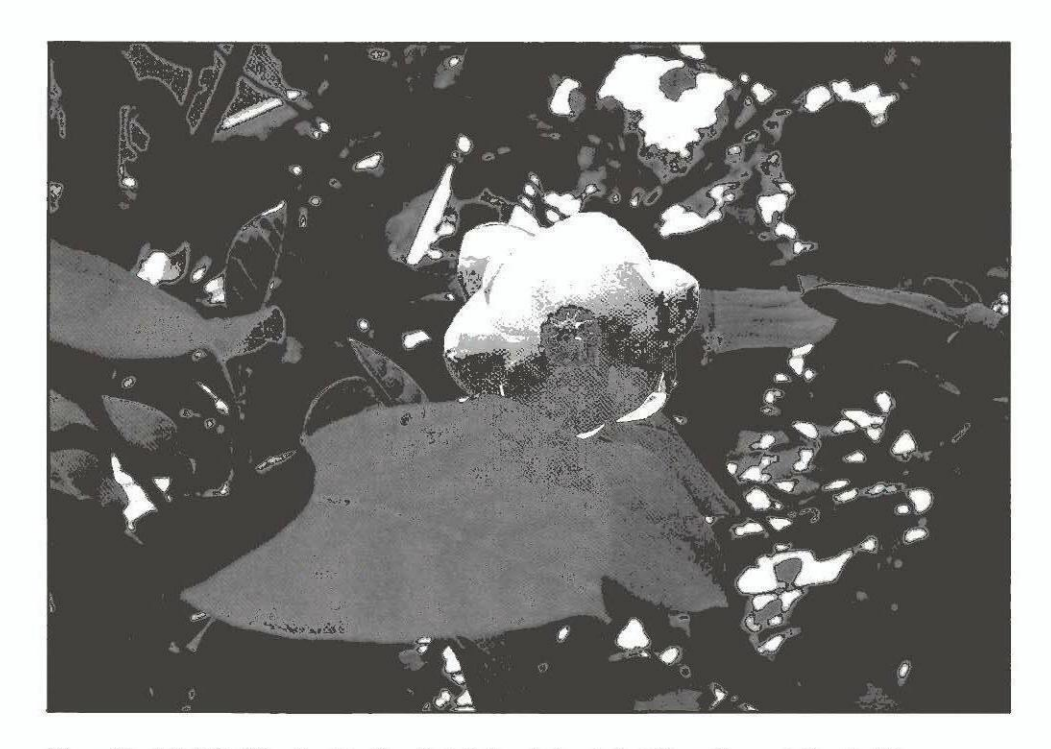
Magnolia sieboldii. The plant in the photo below is located at the railway station in Sira, Norway. This magnolia is thirty years old.