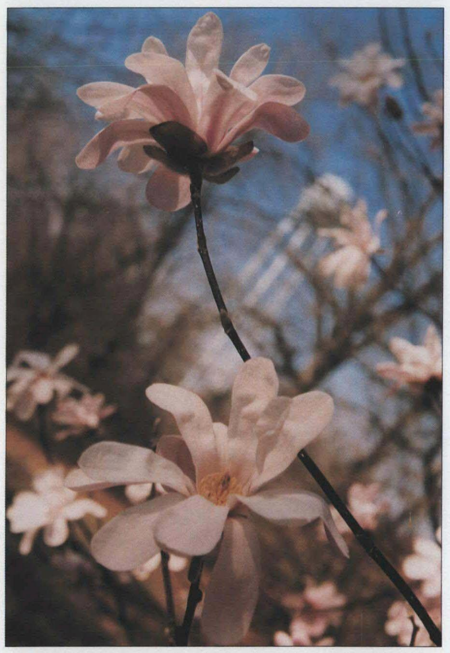
Magnolia x loebneri seedling of 'Leonard Messel.' Possible sibling of 'Raspberry Fun,' from the TMS Seed Counter.