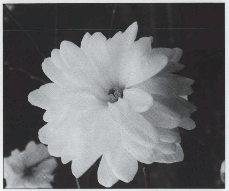
Magnolia x loebneri (seedling of M. kobus var. borealis) with 52 tepals. Seed from TMS Seed Counter.

coloring. It is too early to evaluate them.