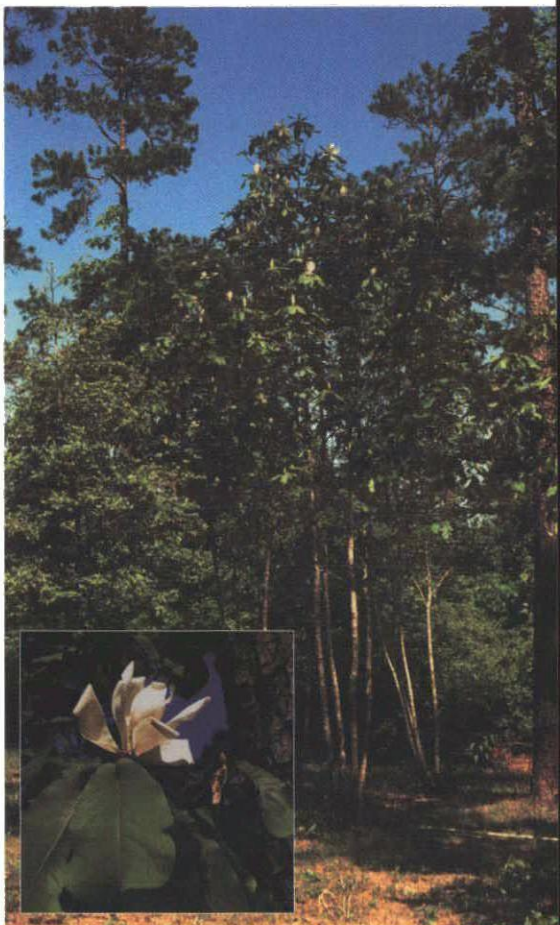
M. pyramidata photographed in the sand hills east of Jasper, Texas.

miss the best part of the day. At about 2 PM I pulled off the road on Middle Mountain at a stretch where many magnolias were in bloom. Unfortunately, these trees were really trees, most over 50 feet (15m) high, with few blossoms within reach. Despite the size of the trees, there were still enough low hanging blossoms to work with.