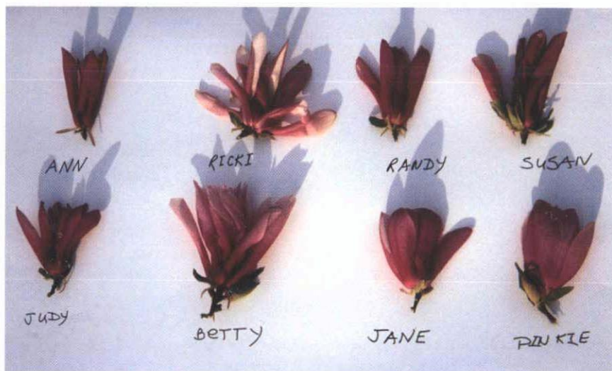
Composite image showing flowers from each of the Girls.