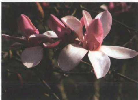
Flower detail on Magnolia 'Jane.'