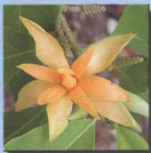
Magnolia (Michelia) champaca Joy Perfume tree

www.TopTropicals.com Rare plants for home and garden