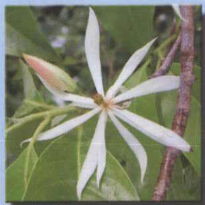
Magnolia (Michelia) x Alba White Champak