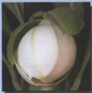
Magnolia coco Coconut Magnolia