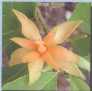
Magnolia (Michelia) champaca Joy Perfume tree

www.TopTropicals.com Rare plants for home and garden