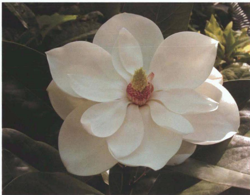
Magnolia 'Exotic Star'