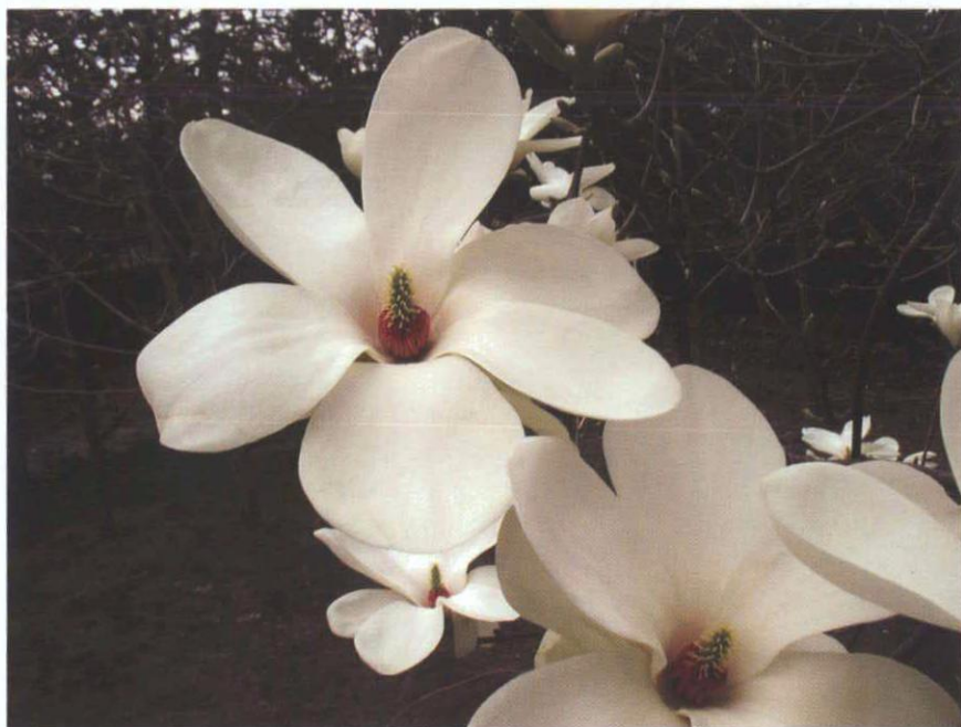
Magnolia 'String of Pearls.'