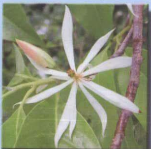
Magnolia (Michelia) x Alba White Champak