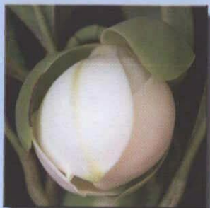
Magnolia coco Coconut Magnolia